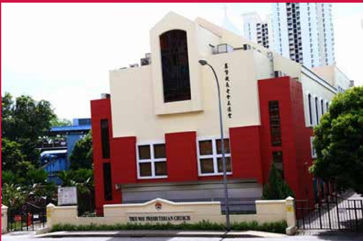
True Way Presbyterian Church