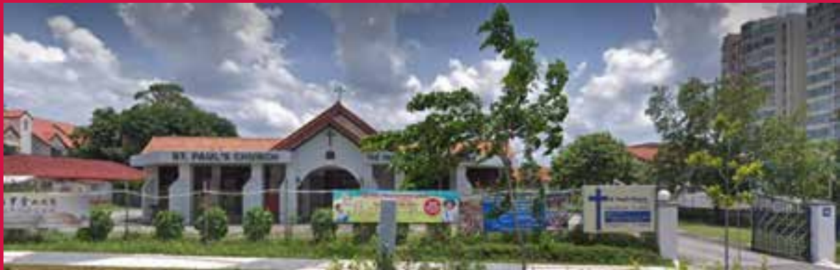
St Paul's Church

The children's programme is anchored in two key churches: